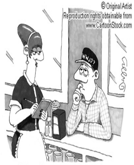
"It's a simple enough question. White, rye or whole wheat?"